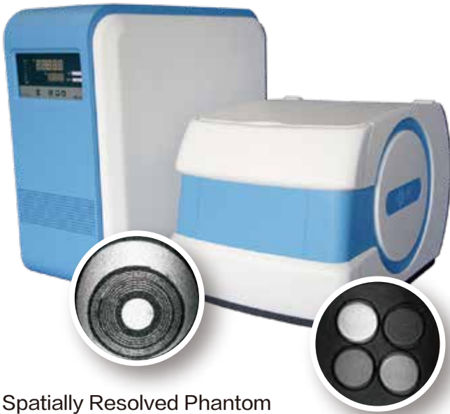
Spatially Resolved Phantom