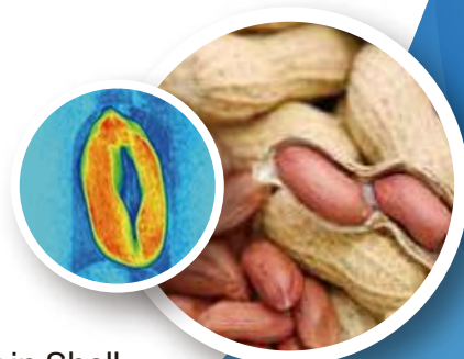
Peanut in Shell